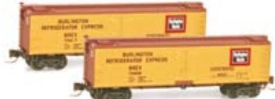
40' Wood Reefer Burlington Refrigerator • Rd# 74606 / #74617 Item# 518 00 031...$24.90 • Item# 518 00 032...$24.90