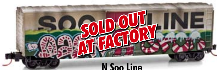
N Soo Line #038 44 440...$26.70

Contact Your Local Dealer for Availability!