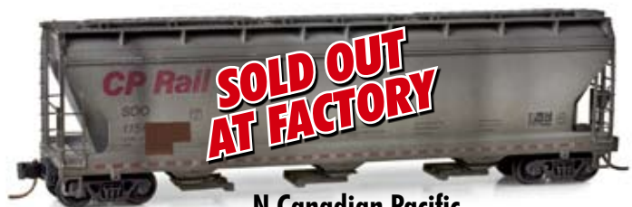
N Canadian Pacific #094 44 090...$28.75