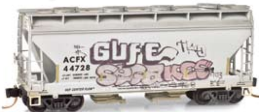
N American Car & Foundry #092 44 310...$28.90