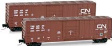
50' Standard Box Car, Single Door Canadian National • Rd# 404567 / #404576 Item# 511 00 201...$29.75 • Item# 511 00 202...$29.75