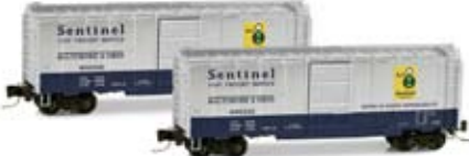
40' Standard Box Car, Plug Door Baltimore & Ohio® • Rd# 466032 / #466096 Item# 500 00 751...$28.90 • Item# 500 00 752...$28.90