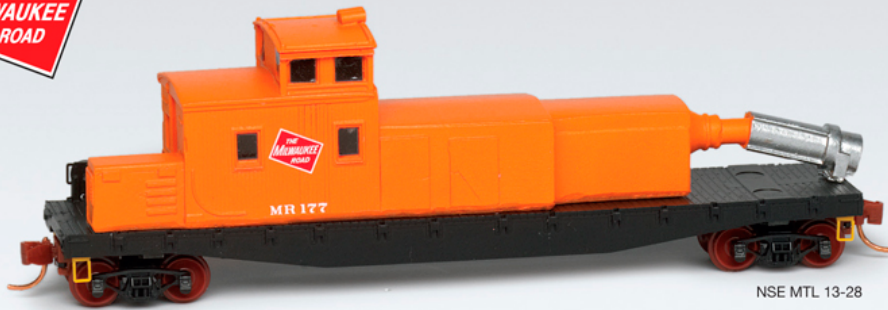
NSE MTL 13-28

When the snow and ice storms blast across the central and northeast states, the railroads arm themselves with every kind of device imaginable to keep the rails clear for train passage. Some of these devices were custom made in their local shops. Such is the case of our cut away caboose frame, flat car, aircraft type engine, heater elements and custom duct work. When combined, this created quite a formidable gadget in unfreezing rail switches as well as moving away snow banks. Our model was produced by Micro-Trains Line, Masterpiece Models and GHP Media.