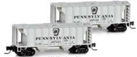
PS2 2Bay Covered Hopper Pennsylvania • Rd# 257152 / #257223 Item# 531 00 021...$21.95 • Item# 531 00 022...$21.95