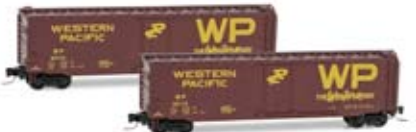
50' Standard Box Car, Single Door Western Pacific® • Rd# 59115 / #59116 Item# 507 00 601...$26.15 • Item# 507 00 602...$26.15