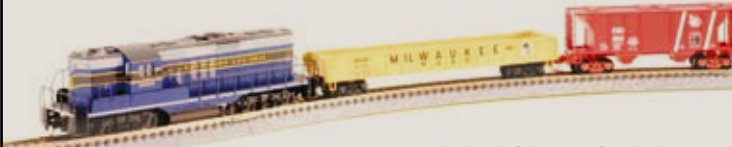
WP®, RI®, & MP® are registered trademarks of the Union Pacific® Railroad.