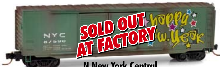
N New York Central #037 44 110...$24.95