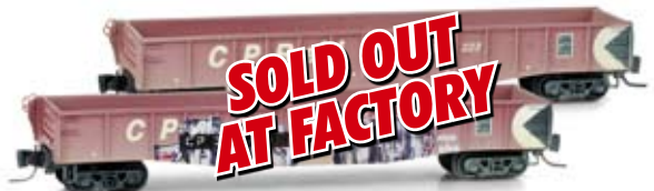
Z Canadian Pacific 2-Pack #522 44 080...$59.95