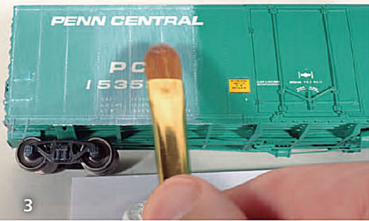
3 Using a soft filbert brush, remove some of the paint and smooth out the finish. Wipe off any excess paint from the brush on a soft piece of cloth.