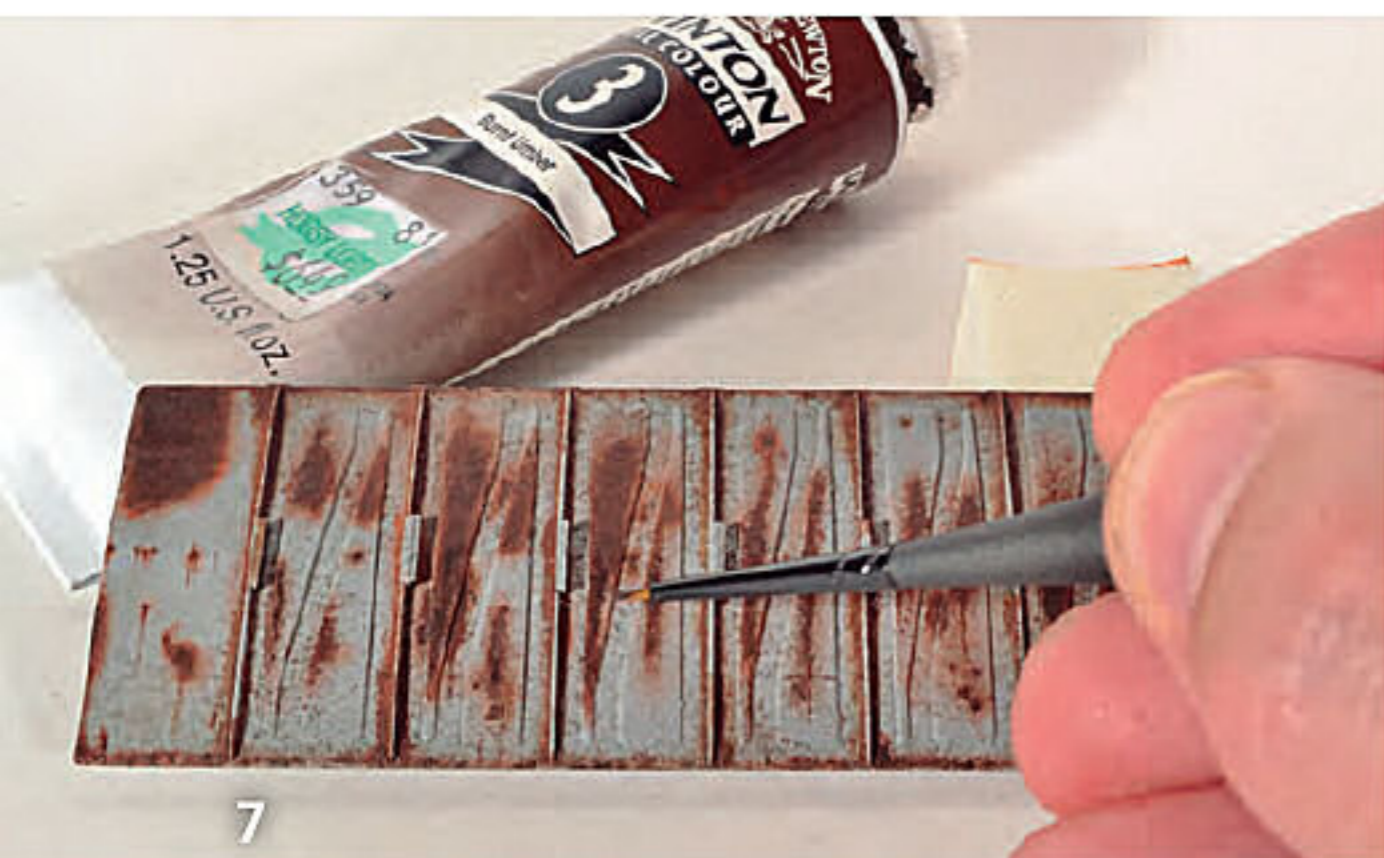
7 Burnt Umber oil paint is used to add darker areas of rust to the middle of the rust spots. The roof was finished by adding some light applications of AK Track Wash and AK Dark Silver powder to the larger areas of rust.