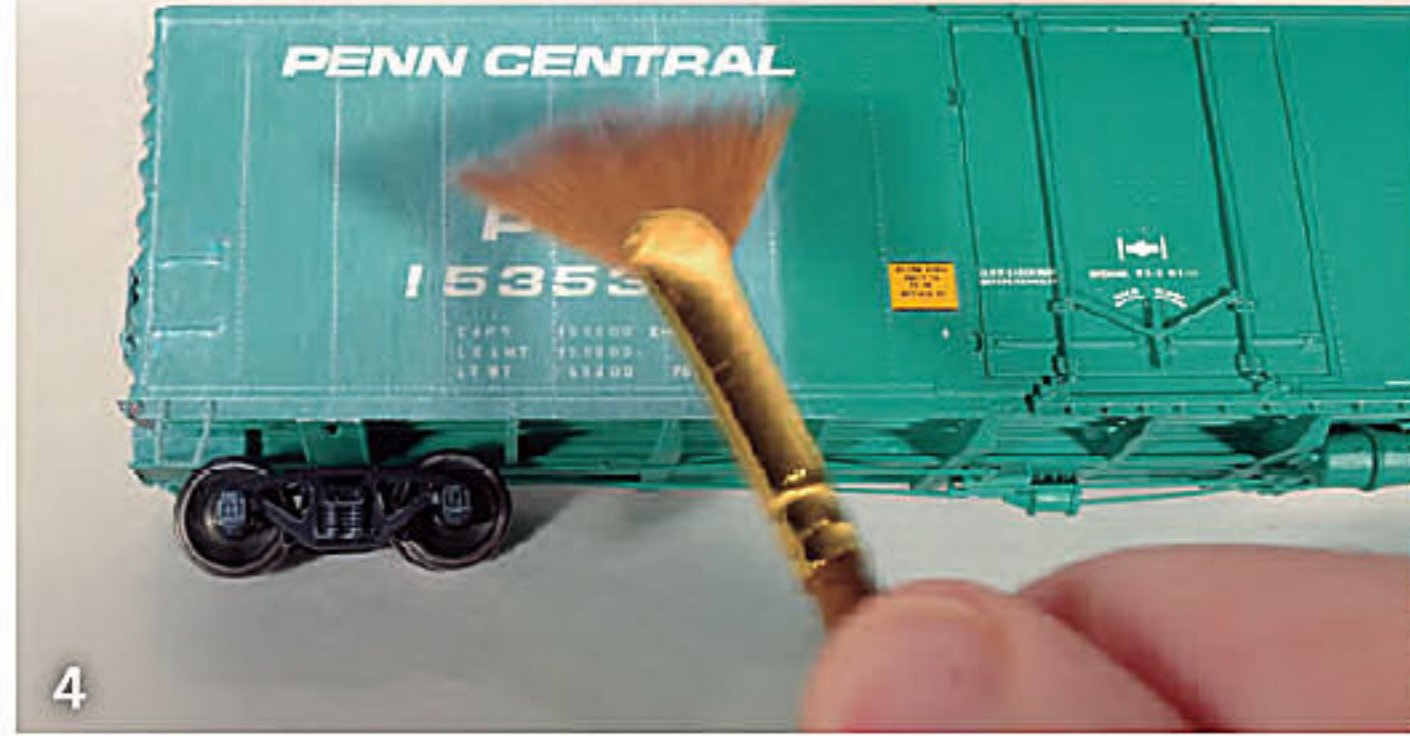
4 A fan brush is used to remove any remaining brush strokes. The white oil paint will need about 2-3 days to fully dry. Once dry, seal it again with Dullcote to prepare the model for following washes and filters.