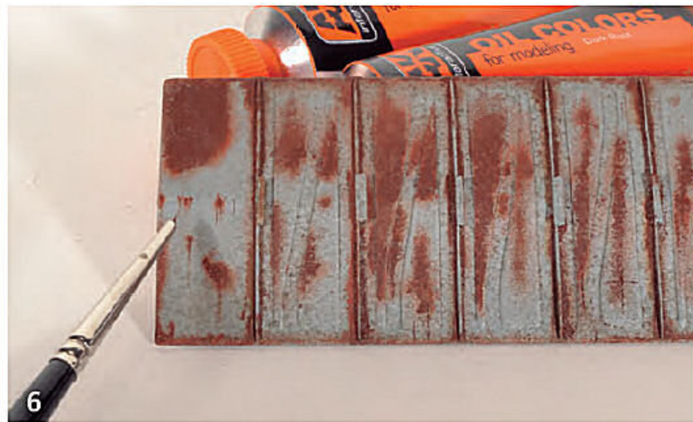
6 Using a trimmed down brush with only two or three bristles, we can add small pits, scrapes, and streaks using oil paints. Make sure the paint goes on smooth and flat, we want to avoid any out of scale texture.