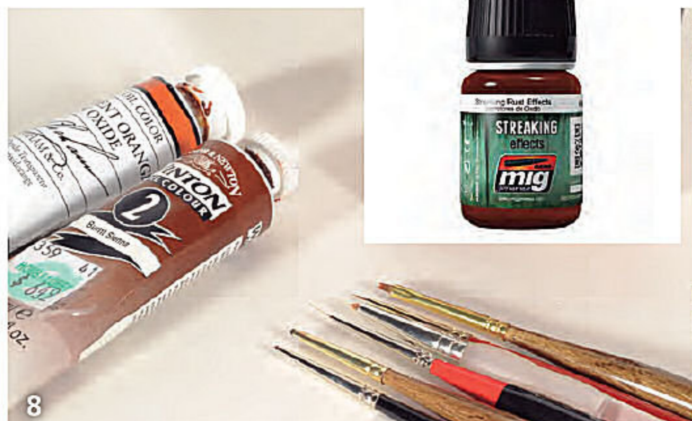
8 To recreate the tiny pits, scrapes, and streaks, we will need to trim down some already small brushes, typically leaving less than five bristles. AMMO of Mig Jimenez, Rust Streaks, Burnt Sienna and Transparent Orange Iron Oxide oil paints work great for streaking effects. For the darker pits and scrapes we will use Burnt Umber oil paint.