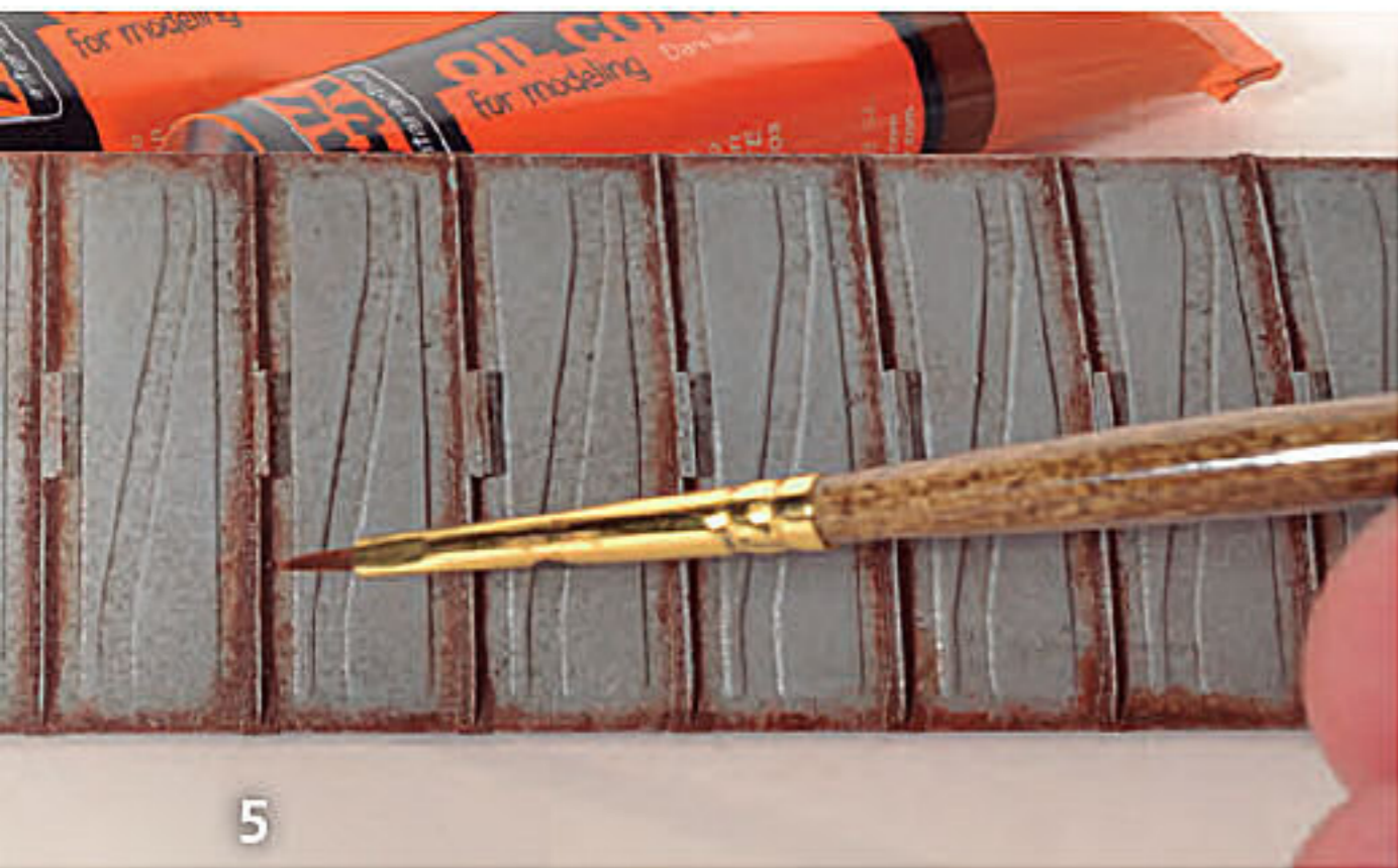
5 Rust is applied to the roof by stippling on rust tones of oil paints. Lightly flood the edges of rust with Odorless Thinner to soften the edges and create some slight runoff.